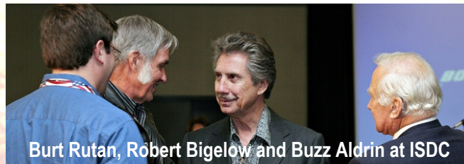
Burt Rutan, Robert Bigelow and Buzz Aldrin at ISDC

Get Energized – Make new friends at our annual International Space Development Conference (ISDC®), and compare notes, assess the status, and plan for the future. Meet astronauts, government and space industry leaders, space entrepreneurs, scientists, educators, and space advocacy leaders. Network and learn about the latest advances in space exploration and development at ISDC talks, meal events, workshops, tours, exhibits, and fun socials. See: isdcs.nss.org