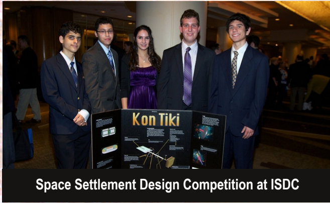
Space Settlement Design Competition at ISDC