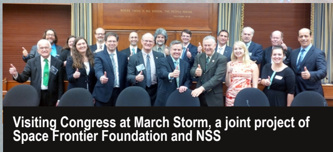
Visiting Congress at March Storm, a joint project of Space Frontier Foundation and NSS

Make the Case for Space – Ensure your voice is heard. Shape the space legislative agenda by sharing your views and priorities on various current and future space projects. NSS offers multiple avenues, such as the NSS Political Action Network (PAN), the Space Exploration Alliance Legislative Blitz, the March Storm, the Alliance for Space Development, and more that enable you to make the case for space with your elected officials. See: go.nss.org/legislative