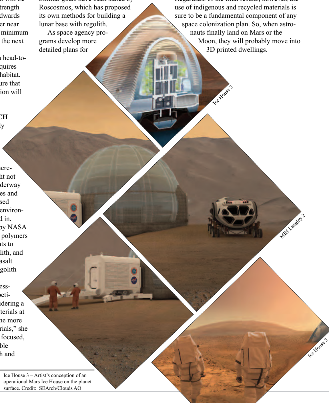
MIH Langley 2 – Artist’s conception of the modified Mars Ice Home concept on the planet surface.

What form will the final approach take? Will there be only one practical design? NASA will know more when the 3D Printed Habitat competition concludes in 2018. Regardless of the final results, however, the use of indigenous and recycled materials is sure to be a fundamental component of any space colonization plan. So, when astronauts finally land on Mars or the Moon, they will probably move into 3D printed dwellings.